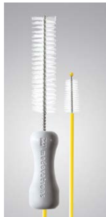
Heavy Duty Combination Brush 1200-09 This convenient dual-ended brush features a valve brush with a comfortable grip on one end and a channel brush on the other. Its wire-reinforced catheter remains firm to glide through longer channels.