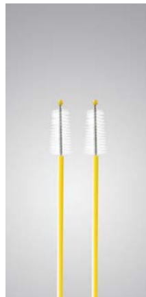
Heavy Duty Dual Ended Brush 1200-08 This heavy-duty dual-ended brush features soft bristles, a protective plastic tip, and a compact head that provides optimal cleaning.