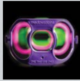
Endoscope Care & Accessories

At Medovations, we are committed to providing you with high-quality, durable products for your gastrointestinal procedures. See the complete line of GI solutions at Medovations.com