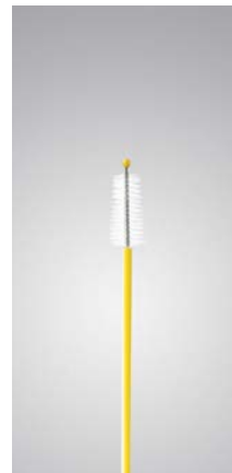
Heavy Duty Standard Brush 1200-07 This simple, effective single-head brush combines a non-slip, wire-reinforced catheter with a tapered head and a protective tip. It's the go-to brush for heavy-duty cleaning.

Our three newest brushes now feature a wire reinforced catheter. These heavy-duty brushes have been designed to handle more rigorous use when cleaning endoscopic equipment. Like all CleanFreak® Endoscope Cleaning Brushes, these new heavy-duty solutions feature a protective tip and soft, yet effective bristles that won't harm sensitive surfaces.